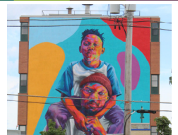
Lamplight Inn 7400 W. Greenfield