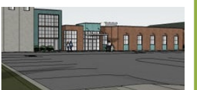
A rendering shows the draft design for the West Allis-West Milwaukee School District's new Recreation and Community Services Center.