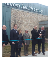
Ribbon cutting at the new Aurora Health Center, located at 6609 W. Greenfield